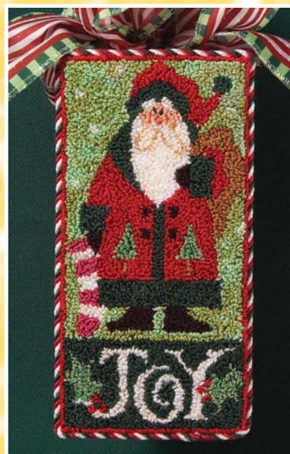
PN022 Santa '08