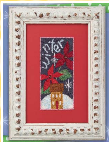
PN021 Winter Cottage