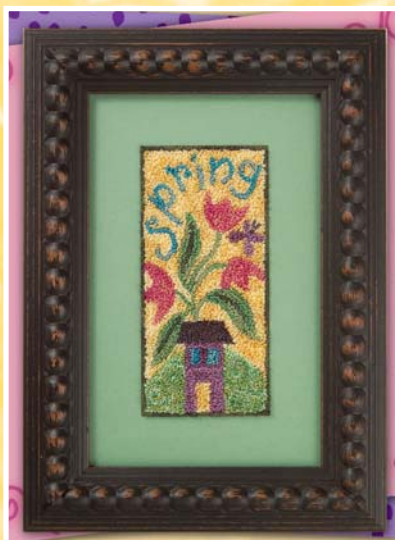
PN018 Spring Cottage