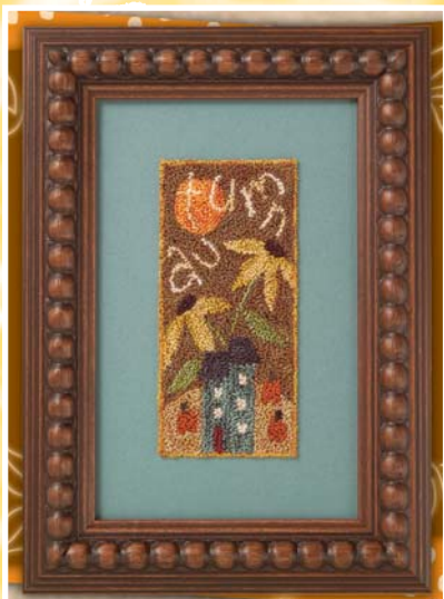
PN020 Autumn Cottage